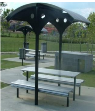
Setting EM003 table, EM002 benches in aluminium with EM513 Marina Shelter option