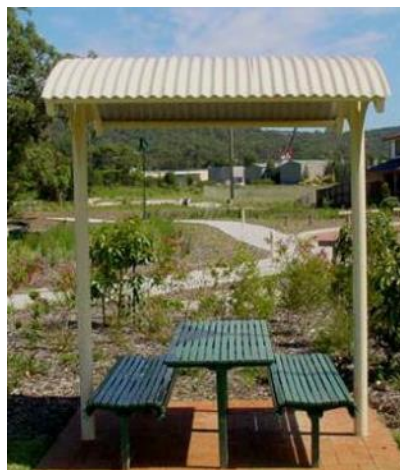
Setting EM003 table, EM002 benches with painted timber battens & EM513 Marina Shelter option